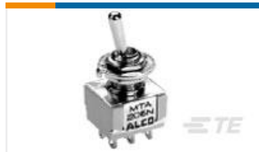
TE Part #7-1437558-5 MTE206R=(MSTE) SW TOG WATERPRO