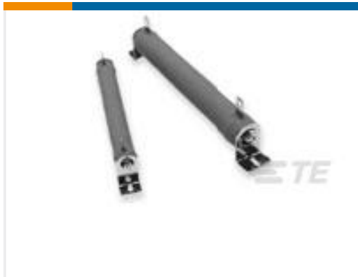
TE Part #3-1879448-6 TE 300W 820R 5% Bracket