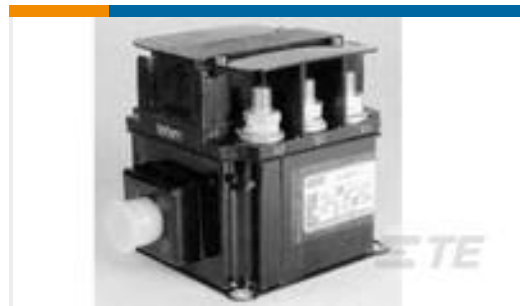
TE Part #1616045-5 B461D1 (FAA/PMA)=CONTACTOR- TPDT CENTER O