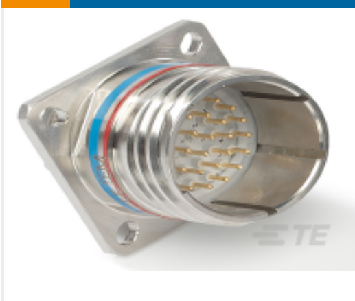
TE Part # YDTS20Z25-19BCV001 RECP ASSY