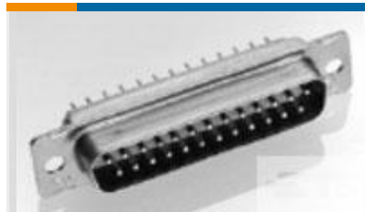
TE Part #204518-2 RECEPT ASSY,62 POSN,AMPLIMITE