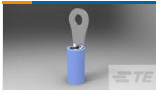
TE Part #324159 TERM, RING, PIDG, 16-14, #4