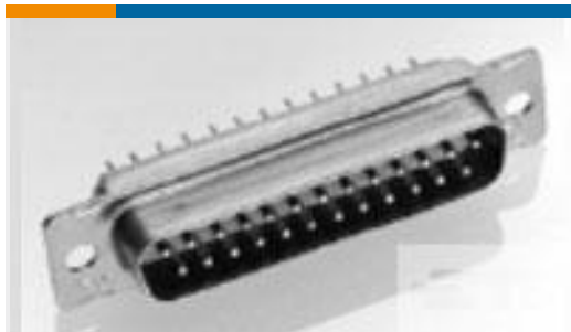
TE Part #204517-2 AMPLIMITE,ASY,PLUG,STD,90,3