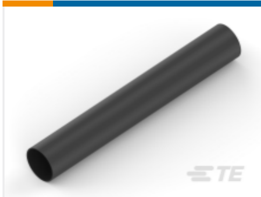
TE Part #NB14354001 VERSAFIT-3/4-0-FSP