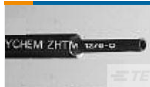
TE Part #4611264003 ZHTM-24/12-0-SP