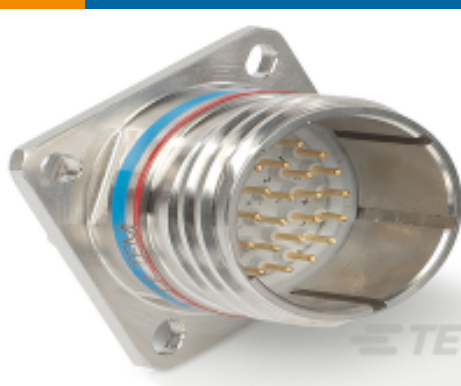
TE Part #YDTS20Z13-35SNV001 RECP ASSY