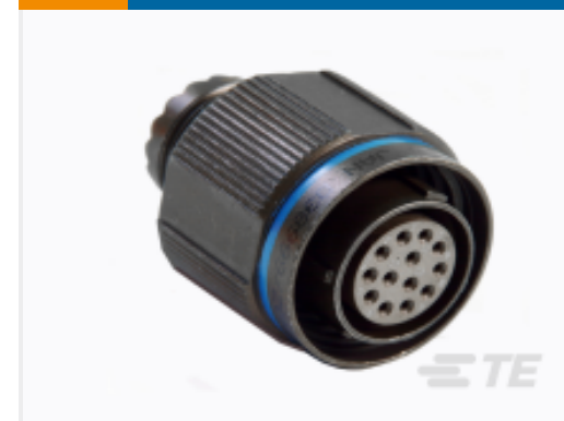
TE Part #YDTS26Z21-16PNV001 PLUG ASSY