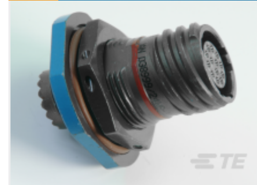
TE Part #YDTS24W23-21SNV001 RECP ASSY