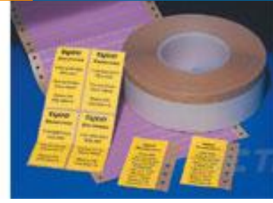
TE Part #192868-000 TTVF200WE-100