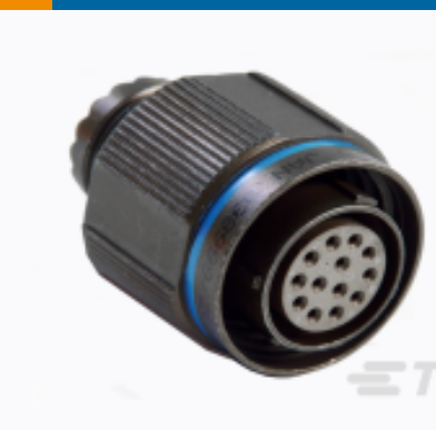
TE Part #YDTS26Z11-35PNV001 PLUG ASSY