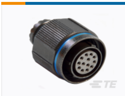
TE Part # CAT-D38999-DTS19O Straight Plug: D38999, 25-19 Insert, Electroless Nickel Plating