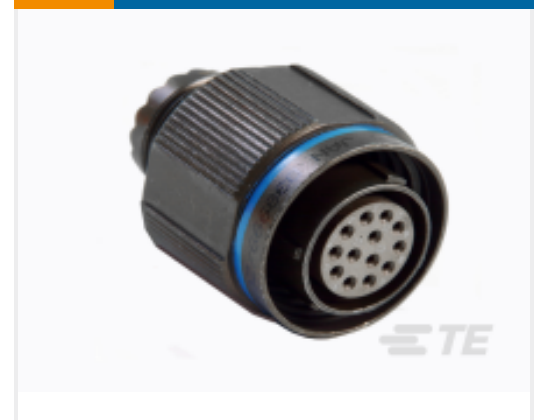
TE Part #YDTS26F11-35PBV001 PLUG ASSY