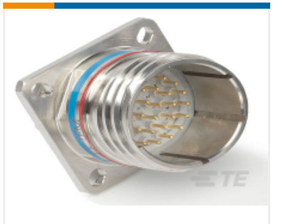
TE Part #YDTS20G19-35PNV001 RECP ASSY