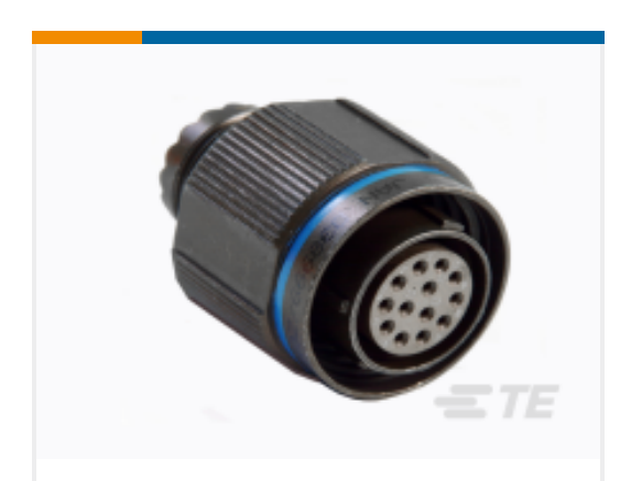
TE Part #YDTS26F17-35PNV001 PLUG ASSY