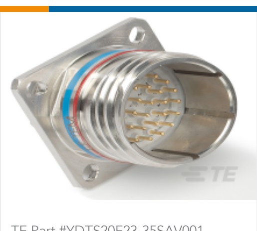
TE Part #YDTS20F23-35SAV001 RECP ASSY