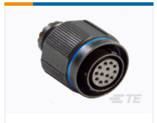
TE Part #YDTS26F17-08PNV001 PLUG ASSY