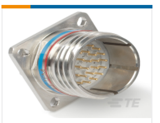
TE Part #YDTS20F25-37PNV001 RECP ASSY