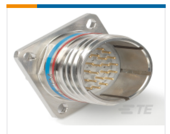
TE Part #YDTS20F25-19PBV001 D38999: Square Flange, 25-19 insert