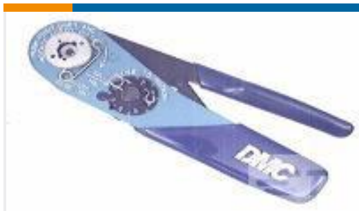
TE Part # 601966-1 CRIMPING TOOL M22520/2-01