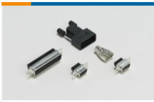
Crimp D-Sub Connectors(10)