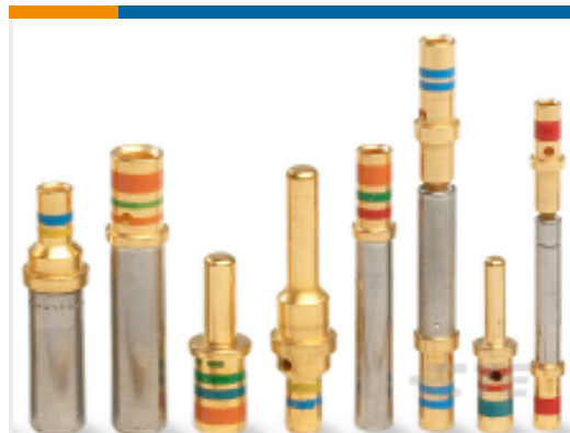
TE Part #ZPF000000000003077 60531 A