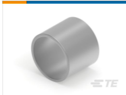
TE Part #1-2308350-6 CRIMP BARREL6