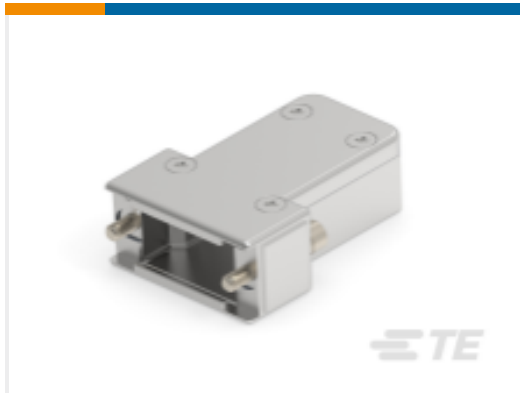
TE Part #1-2308340-1 FULL METAL HOODS SIZE 1