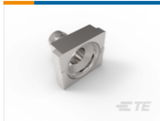
TE Part #1-2308348-9 CRIMP FLANGE 9 LARGE