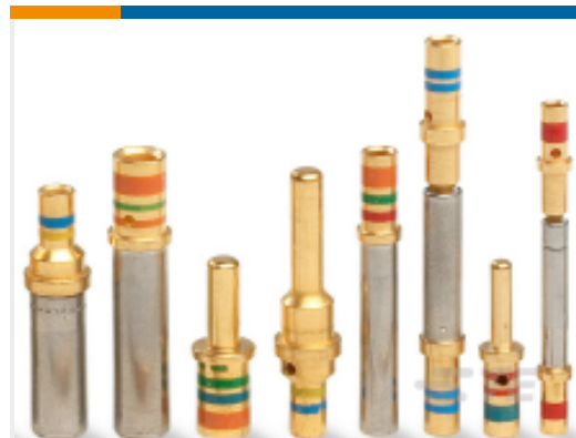
TE Part #ZPF000000000000449 008-0011-16