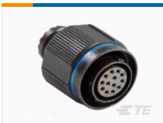
TE Part #ZPF0000000000016896 DTS 26 F 09-35 SN