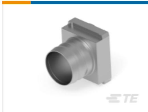
TE Part #1-2308349-1 CRIMP FLANGES SMALL