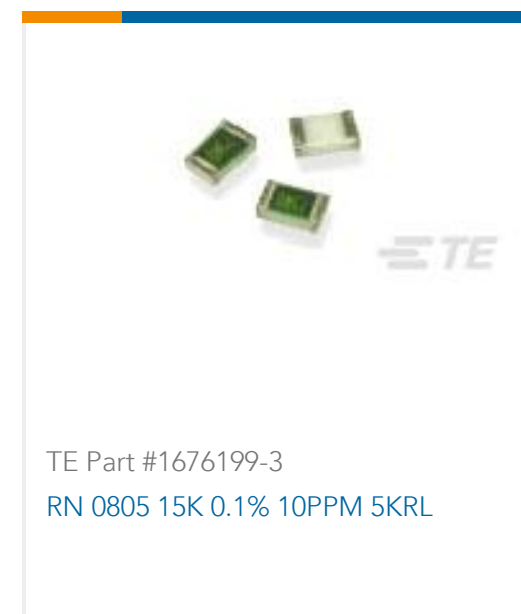
TE Part #1676199-3 RN 0805 15K 0.1% 10PPM 5KRL