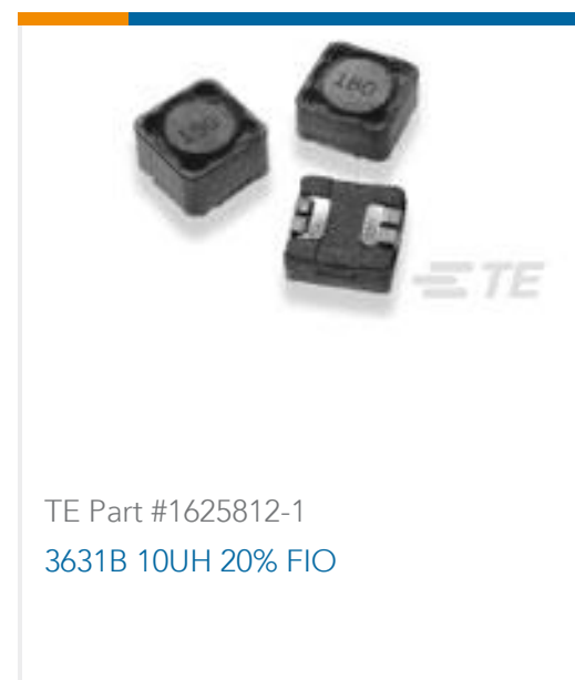
TE Part #1625812-1 3631B 10UH 20% FIO