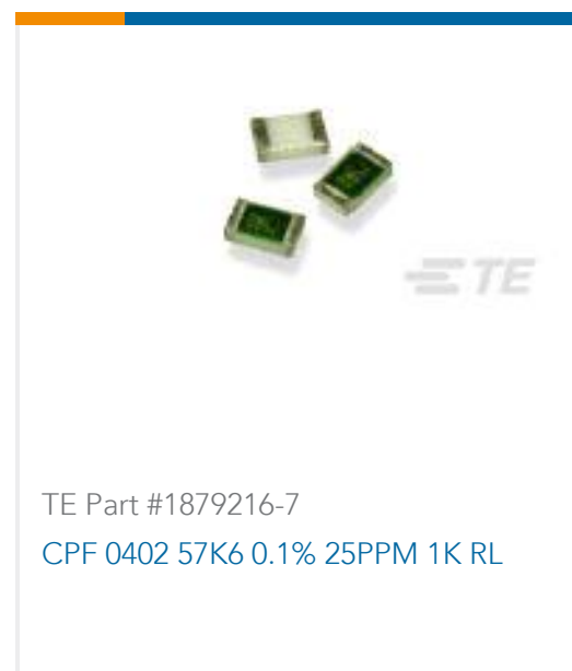
TE Part #1879216-7 CPF 0402 57K6 0.1% 25PPM 1K RL