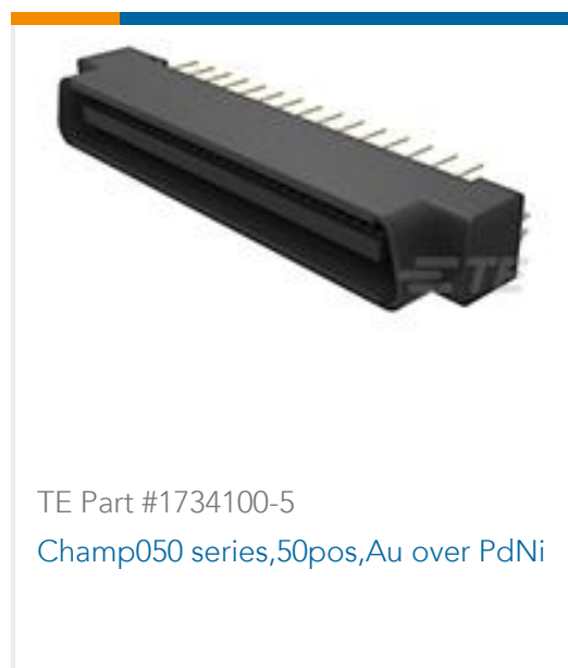
TE Part #1734100-5 Champ050 series,50pos,Au over PdNi