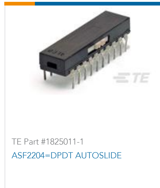
TE Part #1825011-1 ASF2204=DPDT AUTOSLIDE