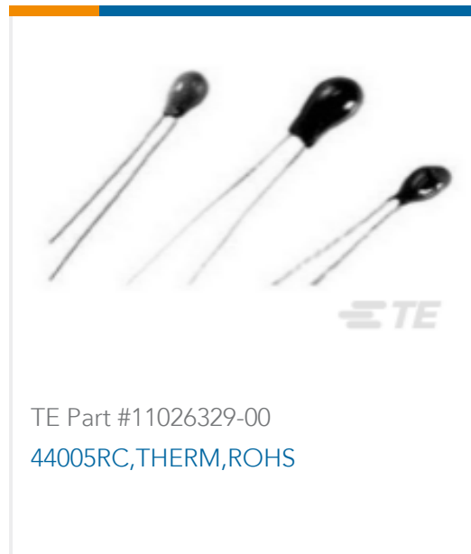
TE Part #11026329-00 44005RC, THERM, ROHS