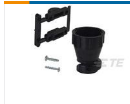
TE Part #206070-8 CABLE CLAMP KIT #17