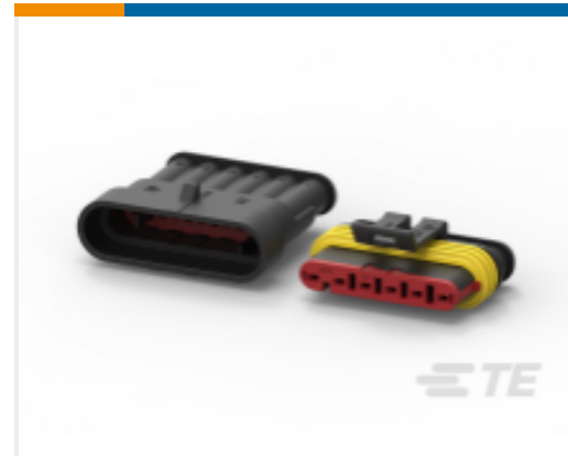
TE Part #282104-1 AMP SUPERSEAL 1.5MM, CONNECTOR HOUSING