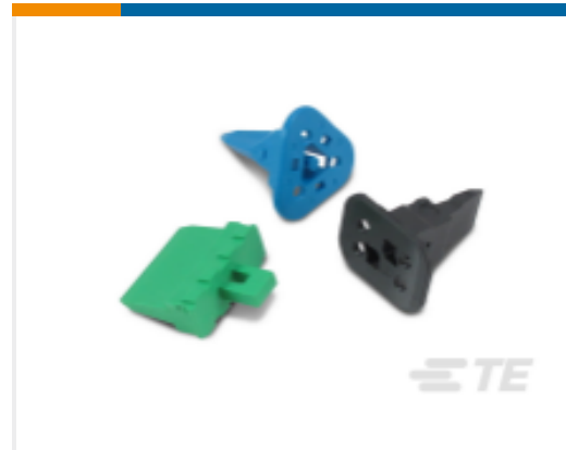
TE Part #W2S DEUTSCH DT WEDGELOCKS