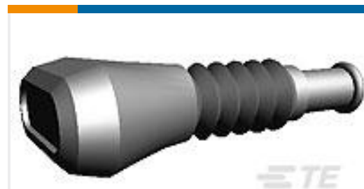
TE Part #493581-1 BOOT 4 POSN HSG