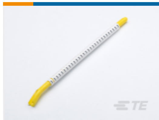
TE Part #5-1768042-1 STD Snap-On Markers