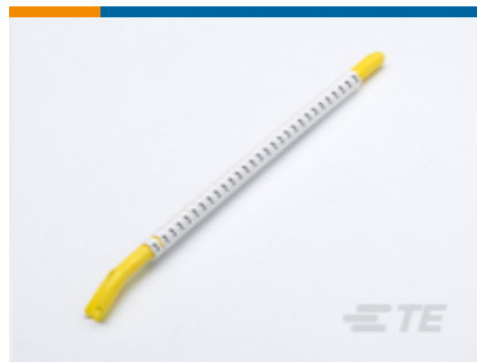
TE Part #5-1768042-1 STD Snap-On Markers