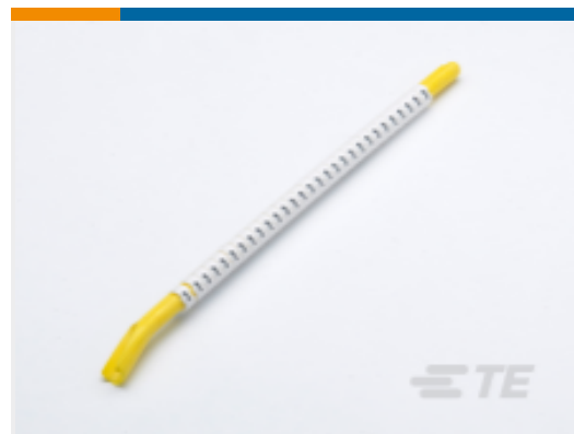
TE Part #6-1768042-8 STD Snap-On Markers