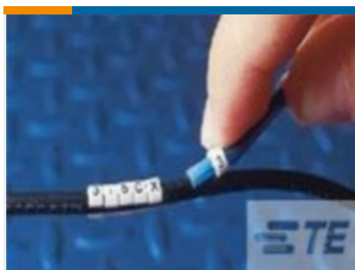
TE Part # 1-1768043-0 STD05W-M