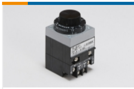
Time Delay Relays(176)