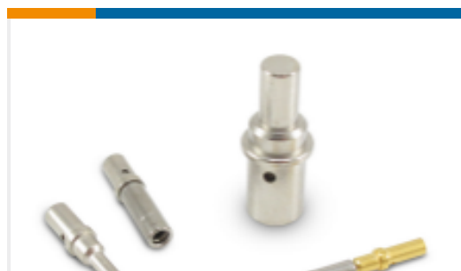
TE Part #0460-202-16141 DEUTSCH SOLID CONTACTS