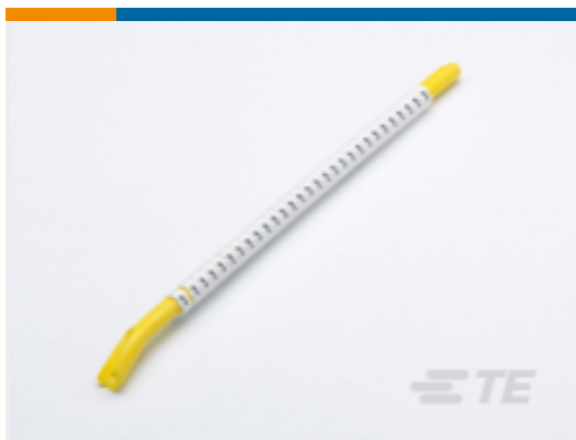
TE Part #700690-000 STD Snap-On Markers