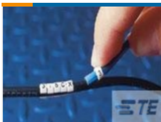
TE Part # 007980-000 STD09Y-7