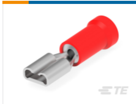
TE Part #5-160483-5 TERM, 187 FAST REC, 032 TAB, PIDG, 22-16