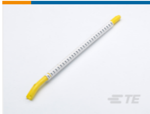
TE Part #434716-000 STD Snap-On Markers