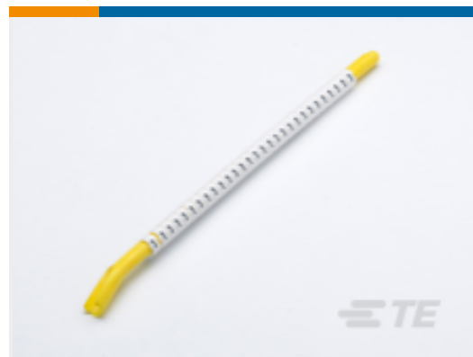
TE Part #127922-000 STD Snap-On Markers