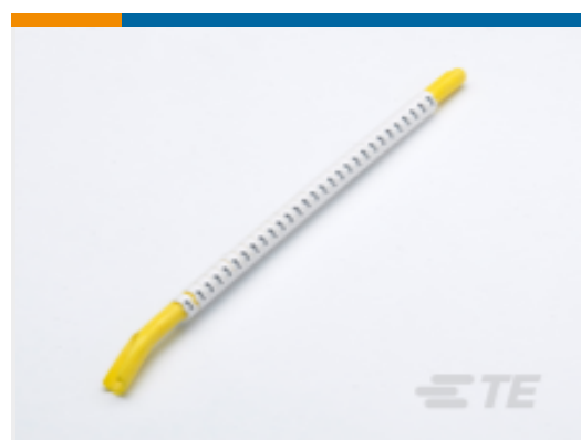
TE Part #7-1768045-8 STD Snap-On Markers