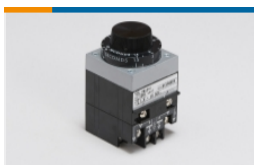
Time Delay Relays(176)