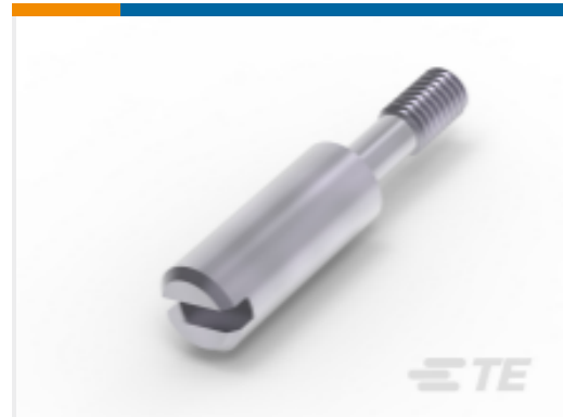
TE Part #T0931003003-000 CODING-PIN-M3