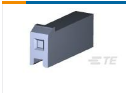
TE Part #640250-1 01P SL156 HSG W/LCK RAMP NATL