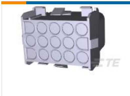
TE Part #1-480711-9 15P UMNL CAP HSG BLK