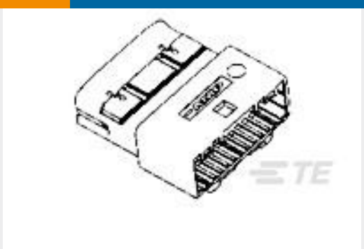
TE Part #1473203-1 025 CAP ASSY 16P P/BACK BRCKT