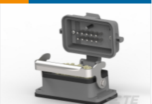
TE Part #T2120100219-000 ZGG-10DSTK,1-7,2-8,3-9,4-6,5-10