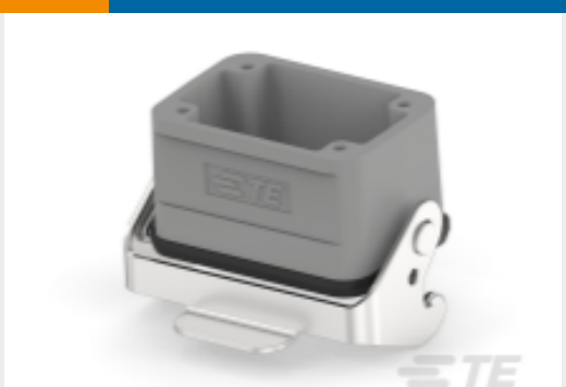
TE Part #T1730060000-000 H6B-TBF-T