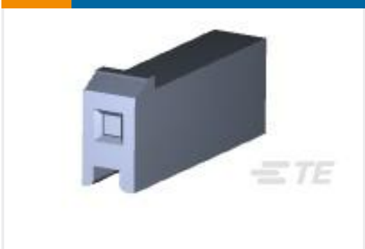
TE Part #640250-1 01P SL156 HSG W/LCK RAMP NATL