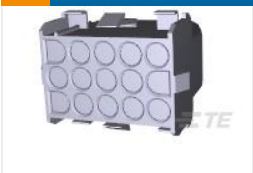
TE Part #1-480711-9 15P UMNLCAP HSG BLK