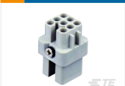
TE Part #T2020082201-000 HD-008-F