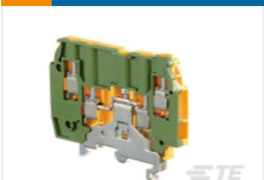
TE Part #1SNA195638R2300 M4/6.4A.P