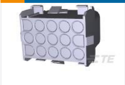
TE Part #1-480711-9 15P UMNL CAP HSG BLK