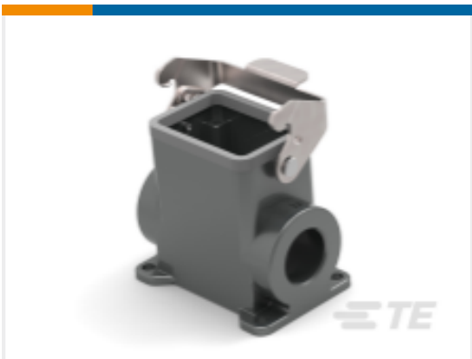
TE Part #T1650063132-000 H6B-SGRH-M32