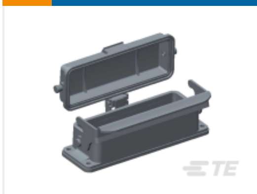
TE Part #T1510243000-000 H24B-AD-LB