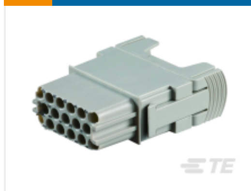
TE Part #T2111172201-000 HMN-017-F