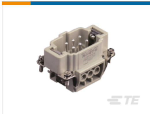
TE Part #T2040062101-000 HE-006-M