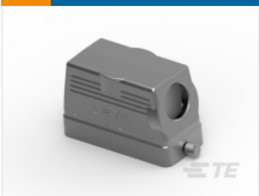
TE Part #T1310160125-000 H16B-TS-RO-M25