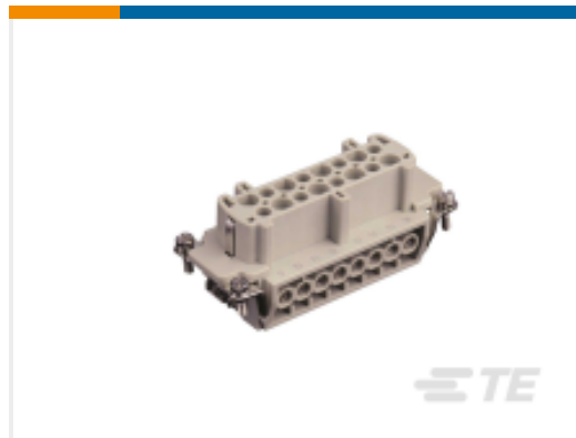
TE Part #T2040322201-000 HE-016-F 17-32