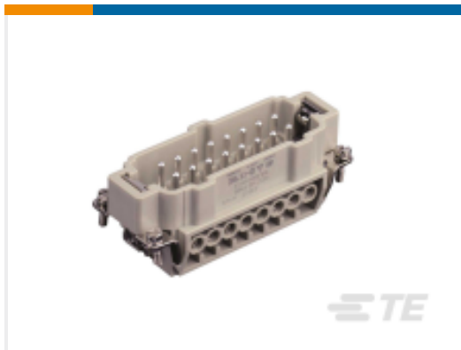
TE Part #T2040322101-000 HE-016-M 17-32