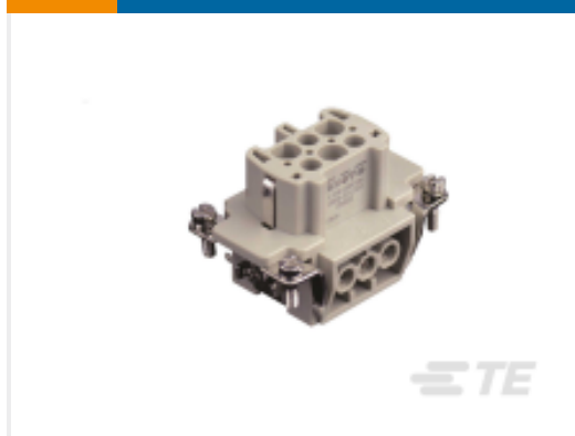
TE Part #T2040062201-000 HE-006-F