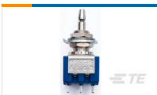
TE Part #1977739-1 MPS103D PSHBTTN SPDT