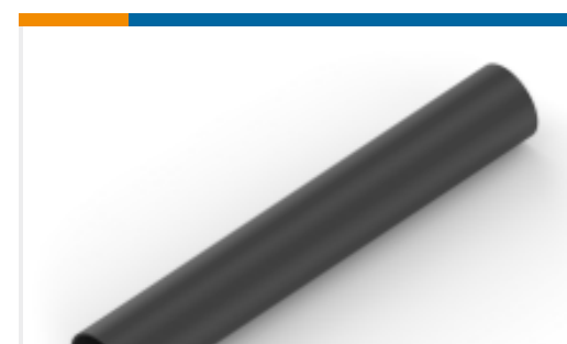
TE Part #NB11644001 ATUM-6/2-0-SP