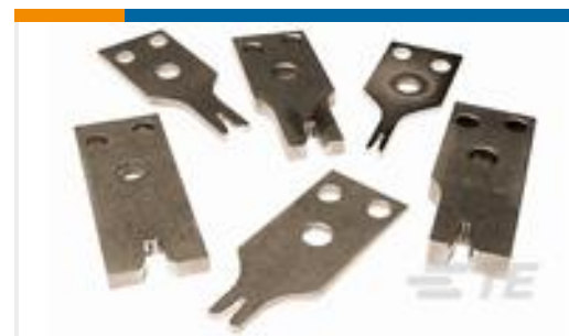
TE Part #1803018-3 CRIMPER, INSUL O