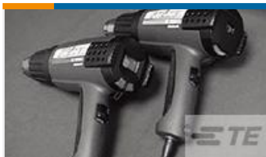
TE Part # CJ2087-000 HL2010E-KIT-120V