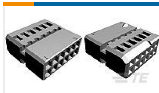
TE Part #284322-1 12POS MQS REC