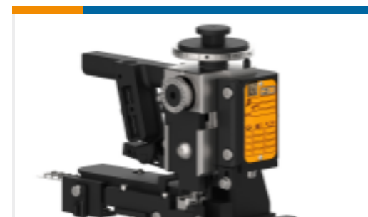
TE Part #2837157-1 OCEAN_2.0_Applicator-S-110F155O