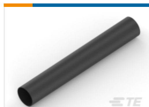
TE Part #NB10726001 ATUM-32/8-0-60MM