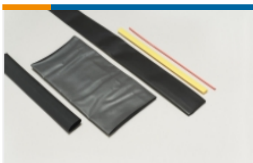
Heat Shrink Tubing(338)