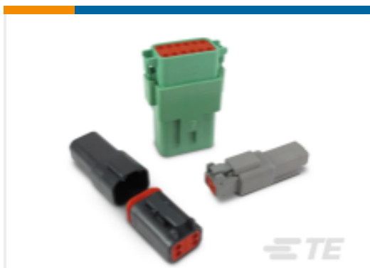
TE Part #DT04-2P DEUTSCH DT Series Housings & Connectors