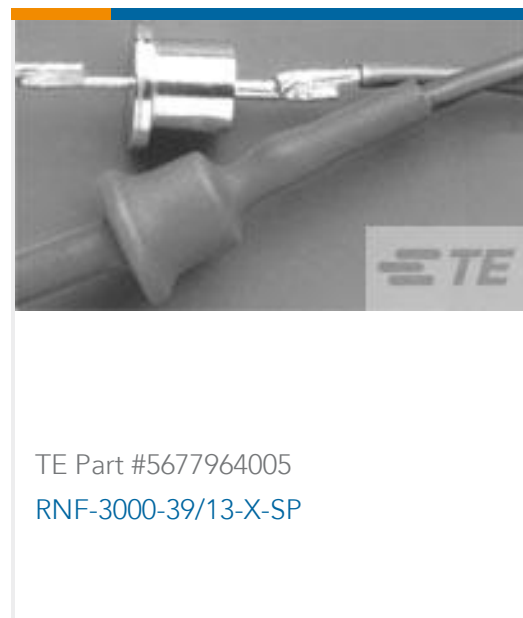
TE Part #5677964005 RNF-3000-39/13-X-SP