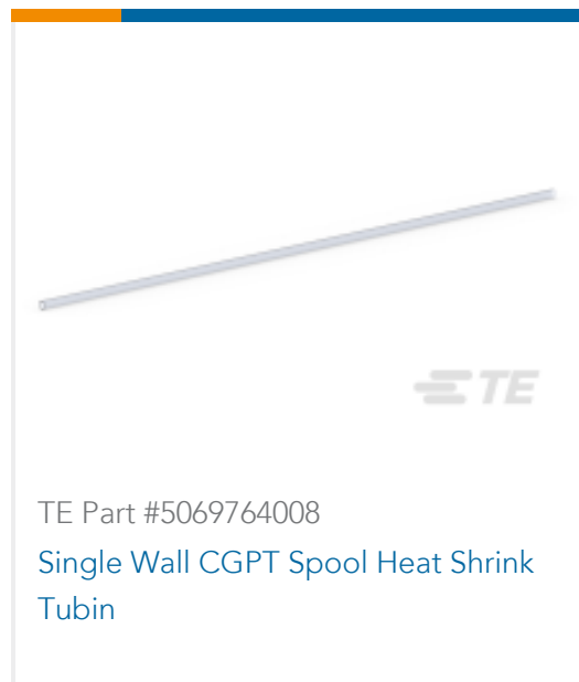
TE Part #5069764008 Single Wall CGPT Spool Heat Shrink Tubin