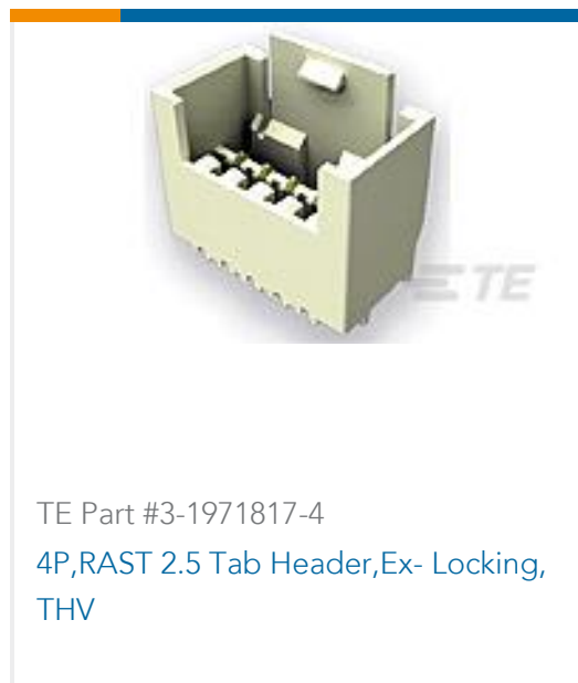
TE Part #3-1971817-4 4P,RAST 2.5 Tab Header,Ex- Locking, THV