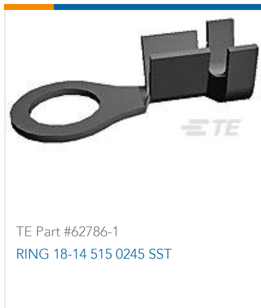
TE Part #62786-1 RING 18-14 515 0245 SST