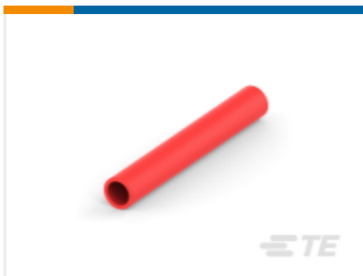
TE Part #7829644001 Dual Wall DWTC Spool Heat Shrink Tubing