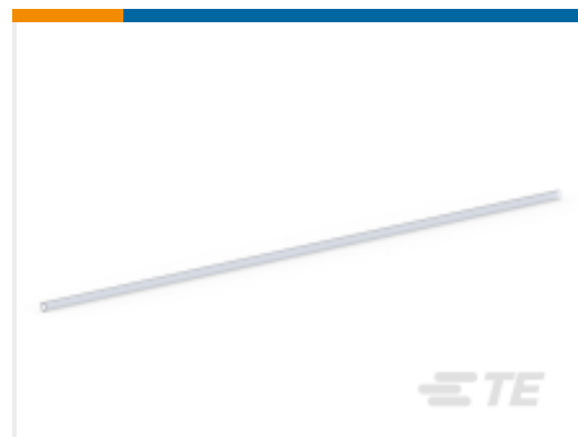
TE Part #5069714007 Single Wall CGPT Spool Heat Shrink Tubing