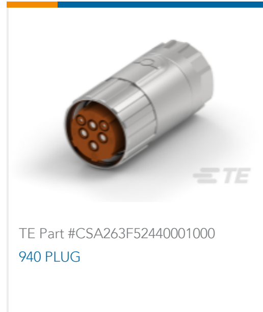
TE Part #CSA263F52440001000 940 PLUG