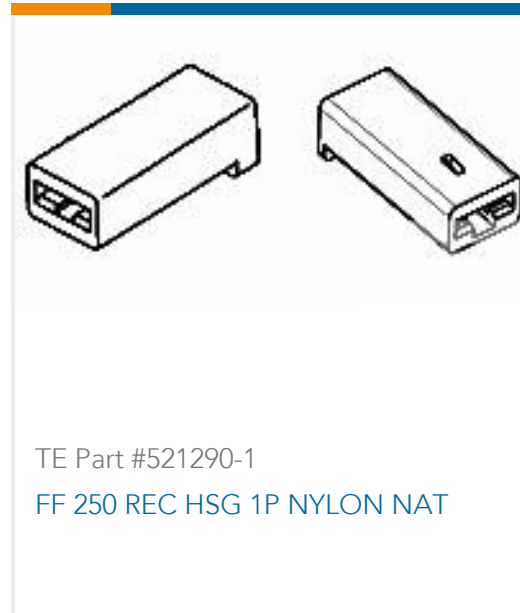
TE Part #521290-1 FF 250 REC HSG 1P NYLON NAT