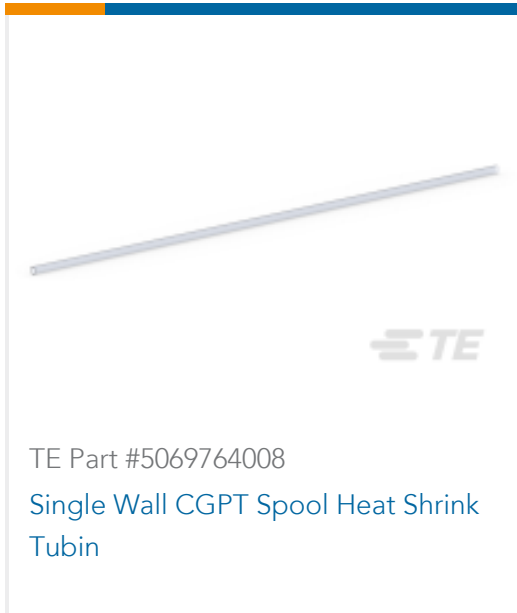
TE Part #5069764008 Single Wall CGPT Spool Heat Shrink Tubin