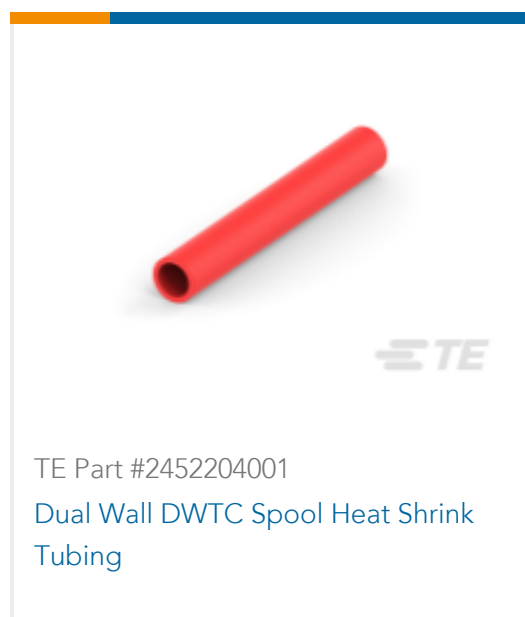
TE Part #2452204001 Dual Wall DWTC Spool Heat Shrink Tubing