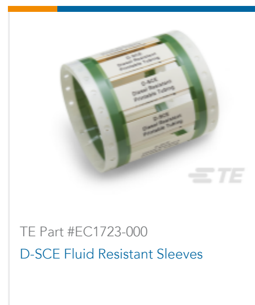
TE Part #EC1723-000 D-SCE Fluid Resistant Sleeves