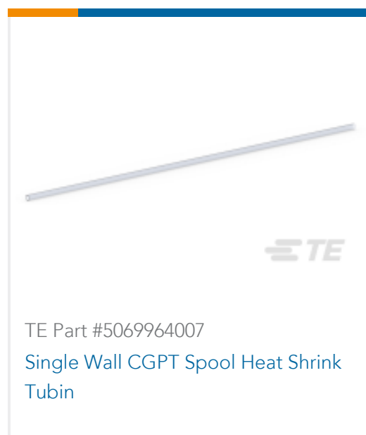
TE Part #5069964007 Single Wall CGPT Spool Heat Shrink Tubing