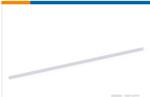
TE Part #5069894005 Single Wall CGPT Spool Heat Shrink Tubin