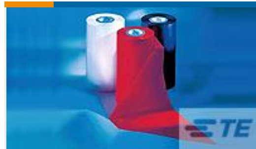
TE Part #C36369-000 1330-0600-T200