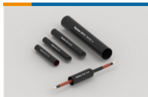
Power Cable Tubing & Accessories(93)