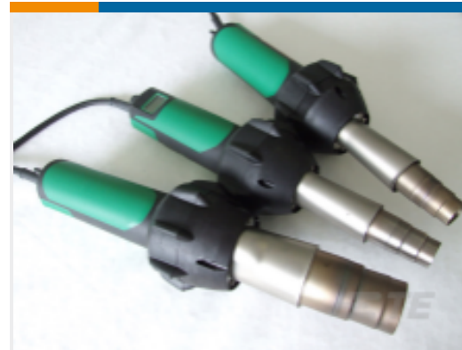
TE Part # EG1114-000 CV1981-ST-230V1600W-EU