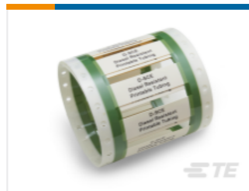
TE Part #EC1913-000 D-SCE Fluid Resistant Sleeves