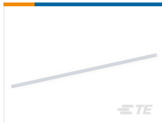
TE Part #5069944006 Single Wall CGPT Spool Heat Shrink Tubing