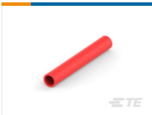
TE Part #2452204001 Dual Wall DWTC Spool Heat Shrink Tubing