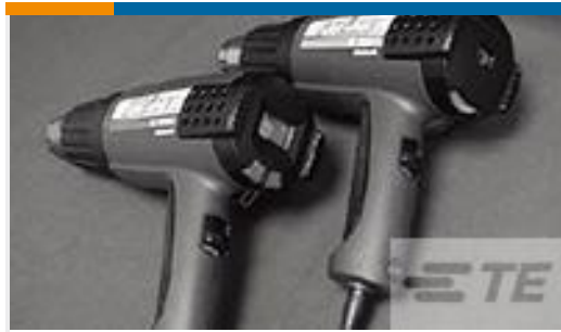
TE Part # CJ2087-000 HL2010E-KIT-120V