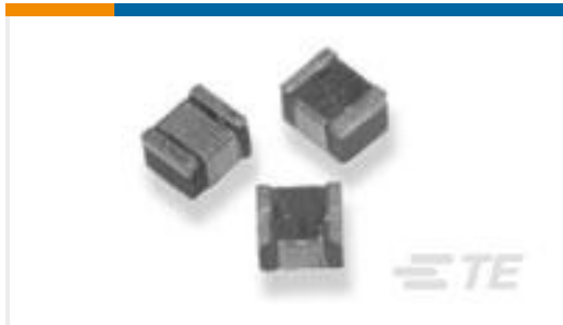
TE Part #1879023-6 3650 1008 22nH 5% 2K RL