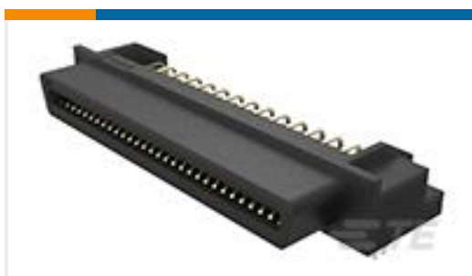
TE Part #5175474-6 CHAMP 050 B/B REC H W/LEG 50P