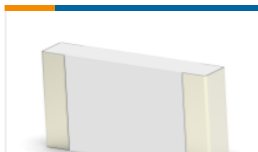
TE Part #5-2176245-5 CRGS1206 5% 33K