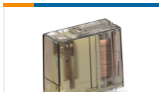
TE Part #8-1415546-7 RP314012