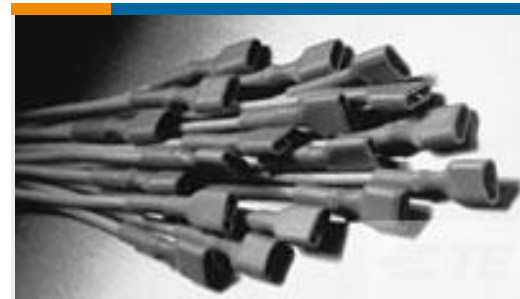
TE Part #2859674001 LSTT-9.5-2-SP