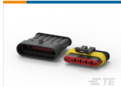
TE Part #282104-1 AMP SUPERSEAL 1.5MM, CONNECTOR HOUSING