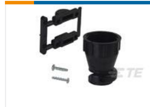
TE Part #206070-8 CABLE CLAMP KIT #17