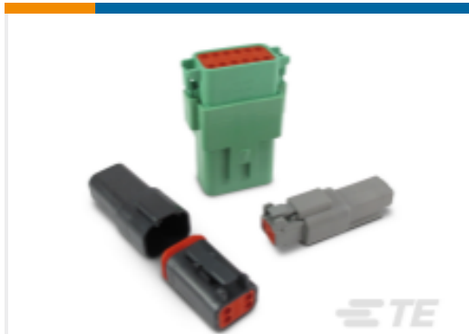
TE Part #DT04-2P DEUTSCH DT Series Housings & Connectors