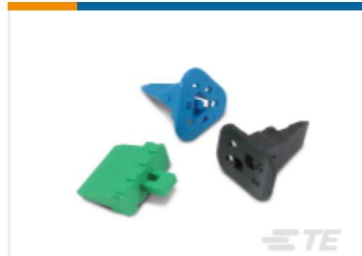
TE Part #W2S DEUTSCH DT WEDGELOCKS