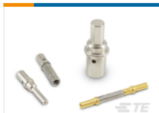
TE Part #0460-202-16141 DEUTSCH SOLID CONTACTS