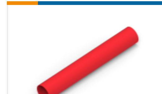
TE Part #NB20074001 VERSAFIT-1/4-2-SP