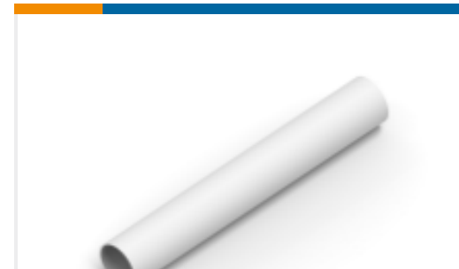
TE Part #NB14604001 VERSAFIT-3/8-9-FSP