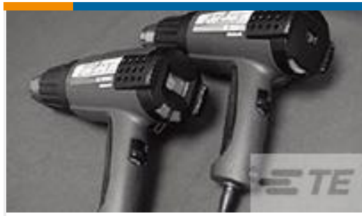
TE Part # CJ2087-000 HL2010E-KIT-120V