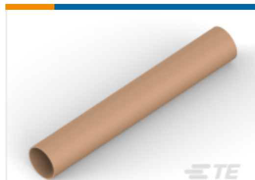
TE Part #5677624001 RNF-3000 Single Wall Spool HS Tubing