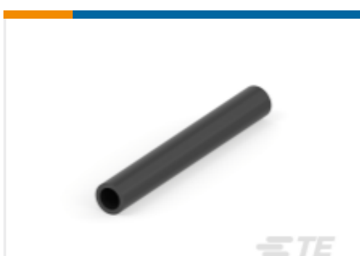
TE Part #NB16544001 RW-175-3/32-0-SP