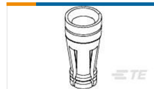
TE Part #7-1437514-0 8134-HC-8P2=HOLTITE CONTACT 3.