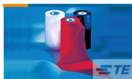
TE Part #124503-000 TMS-RJS-RIBBON-4AG