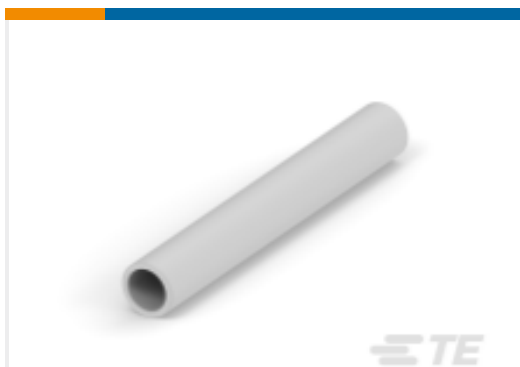
TE Part #5052984035 RNF-3000 Single Wall Stick Heat Shrink