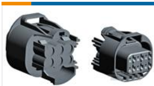
TE Part #1452327-1 JPT HSG ASSY 6P