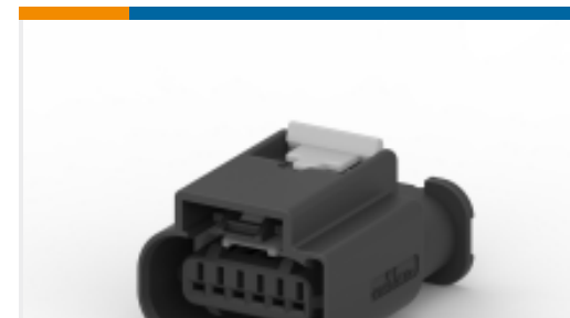
TE Part #2272975-1 6 Pos. Sealed MCON 1.2 Connect