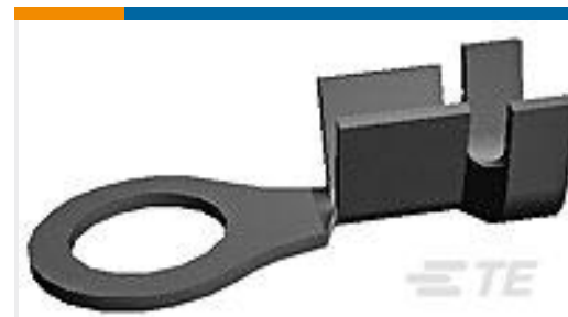
TE Part #41456 RING TERMINAL 20-16 AWG TPBR