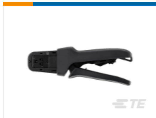
TE Part #DTT-20-03 CRIMP TOOL