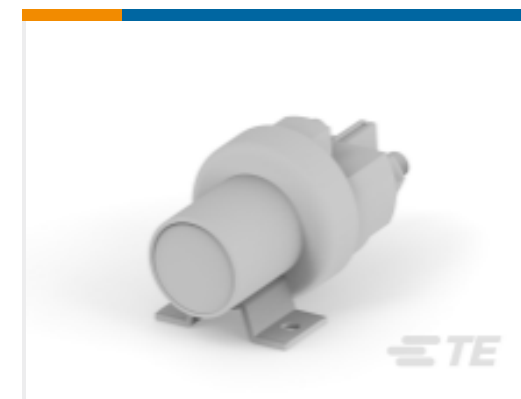
TE Part #K1008699 Relay 26-60-05