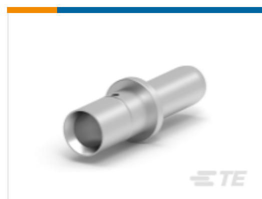
TE Part #SRK-PC-080-25-601 PIN, SOLID, SIZE M8, 25mm2, AG