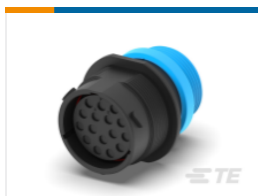
TE Part #HDP24-24-16SE-L015 REC, 16P, BLK, E, THD, 12, S