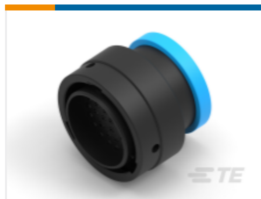
TE Part #YHDP26-24-35PEL017 PLG, 35P, BLK, E, RNG, 16/20, P