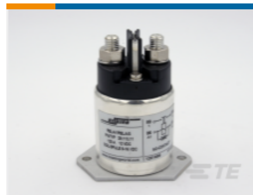
TE Part #K1060489 Relay 29-113-12