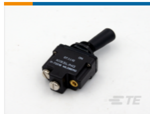
TE Part #K1007153 Toggle Switch 08-1-1-13