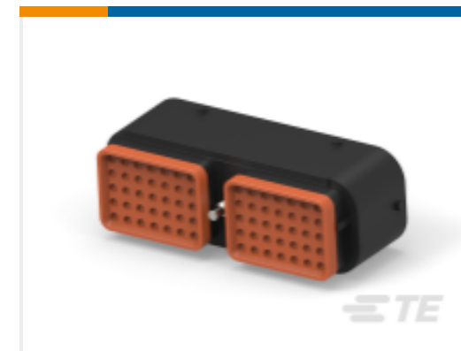
TE Part #DRC16-70SBE-P013UK PLG, 70P, BLK, E, SEAL BOND, B