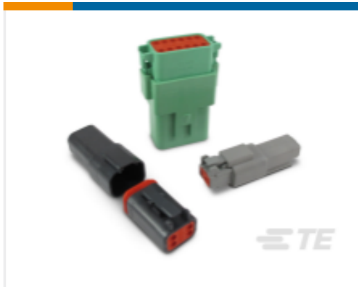
TE Part #DT04-2P DEUTSCH DT Series Housings & Connectors