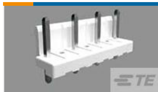
TE Part #1-1123724-2 3.96EP HDR ASSY 2(3)P NATURAL