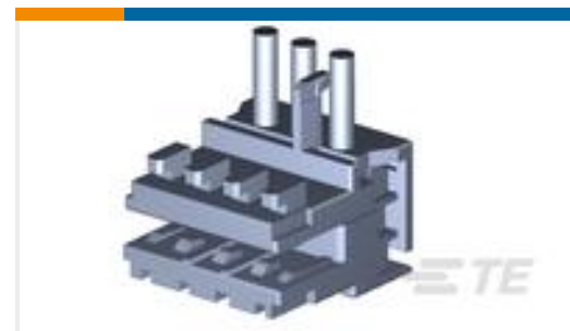
TE Part #1-1740501-3 AMP DUOPLUG2.5 MK II HOUSING W. PCB LOCK