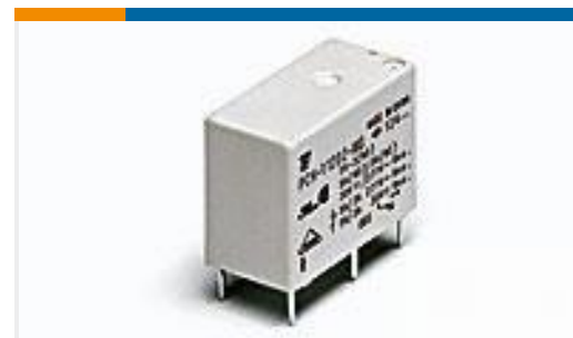
TE Part #1721768-2 PCH-105L2M-WG