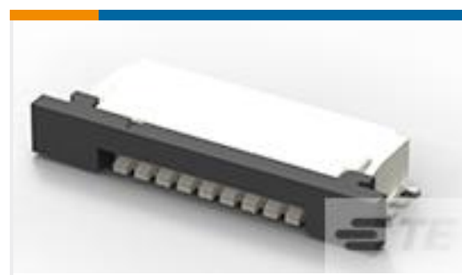
TE Part #1735265-8 1MM FPC HORZ.BOTTOM CONT. ASSY 8P (Au)