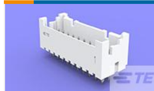
TE Part #1-1969543-4 ASSY, HDR, VERT, BOSSED, DUAL ROW, EP2.5