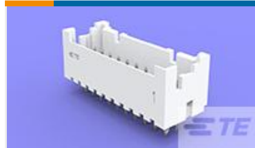
TE Part #2-1969543-2 ASSY, HDR, VERT, BOSSED, DUAL ROW, EP2.5