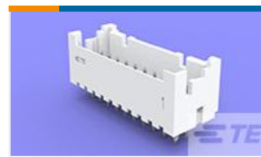
TE Part #2-1969584-8 ASSY,HDR,VERT,GWT,NO-BOSS, DUAL ROW,EP2.5