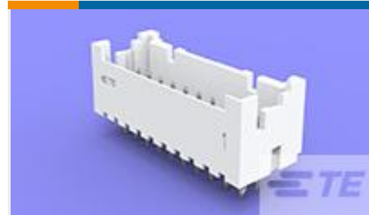
TE Part #1-1969543-6 ASSY, HDR, VERT, BOSSED, DUAL ROW, EP2.5