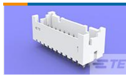
TE Part #1969543-8 ASSY, HDR, VERT, BOSSED, DUAL ROW, EP2.5