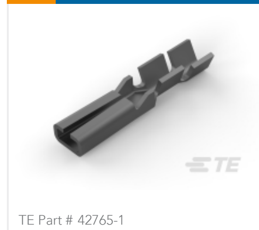
TE Part # 42765-1 TAPER TAB 078 REVERSE REEL REC 24-22TPBR