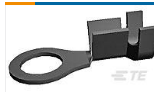
TE Part #42037-2 RING TERMINAL 22-18 AWG TPBR