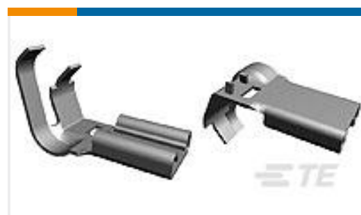
TE Part #41531-1 250 FASTON FLAG REC 18-12 AWG NPST