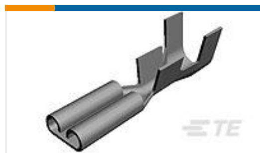
TE Part #60635-3 250 FASTON REC 14-10 AWG BR