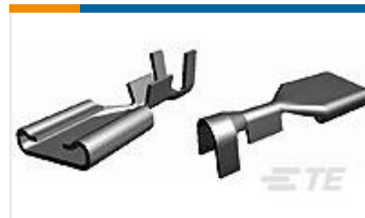
TE Part #42743-1 250 FASTON REC 22-18 AWG BR