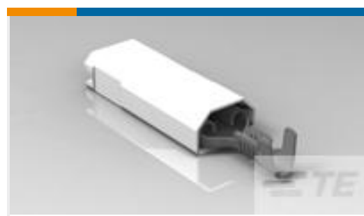
TE Part #521368-2 ULTRA-POD 250 ASSY REC 22-18 AWG TPBR