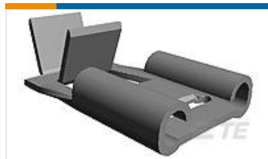
TE Part #63315-1 250 FASTON FLAG 18-14 AWG BR