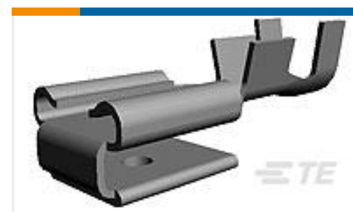
TE Part #61988-1 250 FASTON REC 22-18 AWG BR