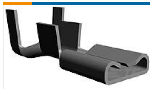
TE Part #42801-1 187 FASTON REC 20-16 AWG BR