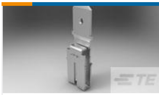
TE Part #63459-2 MAG-MATE 250 F-TAB 15-16 TPBR