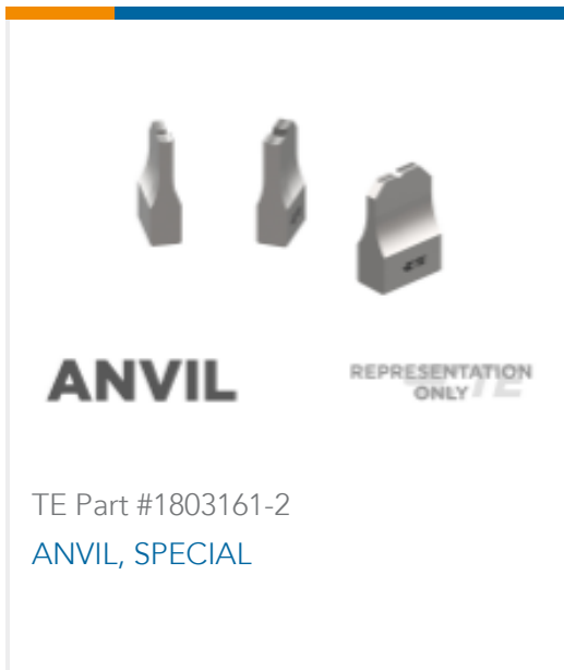
TE Part #1803161-2 ANVIL, SPECIAL