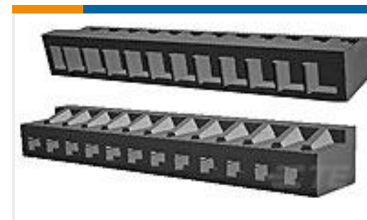
TE Part #172890-2 2P 2MM MINI AMP-IN HDR HSG