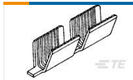
TE Part #62001-1 SPLICE AMVAR 3000-7000 020BR