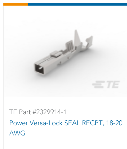
TE Part #2329914-1 Power Versa-Lock SEAL RECPT, 18-20 AWG