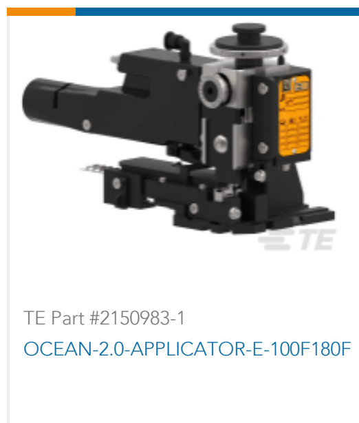
TE Part #2150983-1 OCEAN-2.0-APPLICATOR-E-100F180F