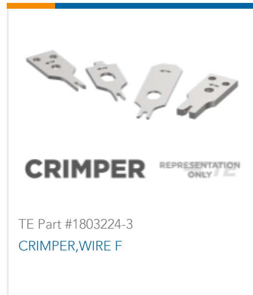
TE Part #1803224-3 CRIMPER, WIRE F