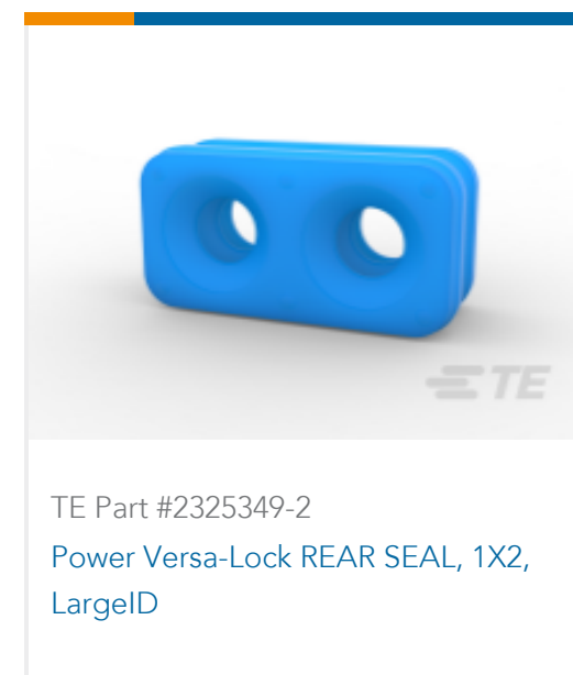
TE Part #2325349-2 Power Versa-Lock REAR SEAL, 1X2, LargeID