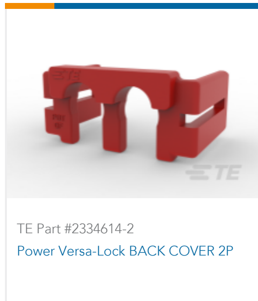
TE Part #2334614-2 Power Versa-Lock BACK COVER 2P