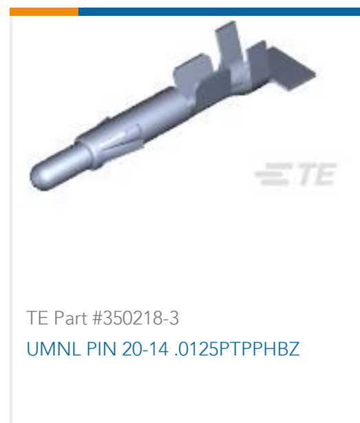
TE Part #350218-3 UMNL PIN 20-14 .0125TPPHBZ