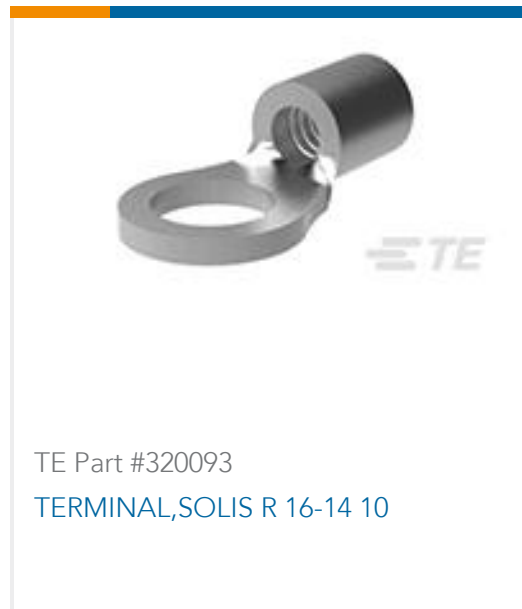
TE Part #320093 TERMINAL,SOLIS R 16-14 10