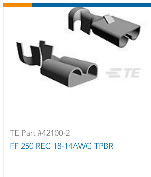
TE Part #42100-2 FF 250 REC 18-14AWG TPBR