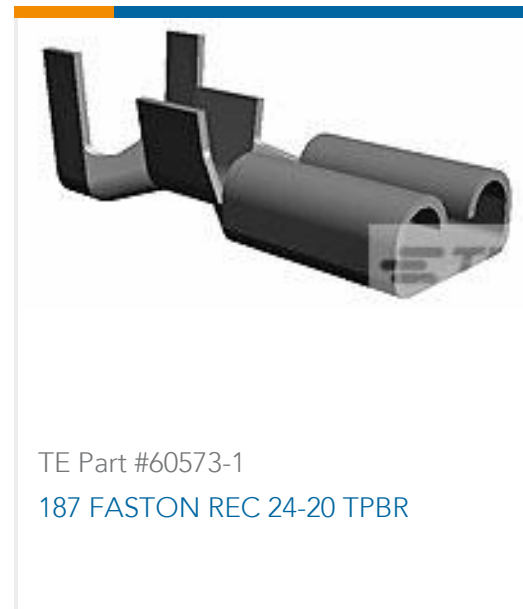
TE Part #60573-1 187 FASTON REC 24-20 TPBR