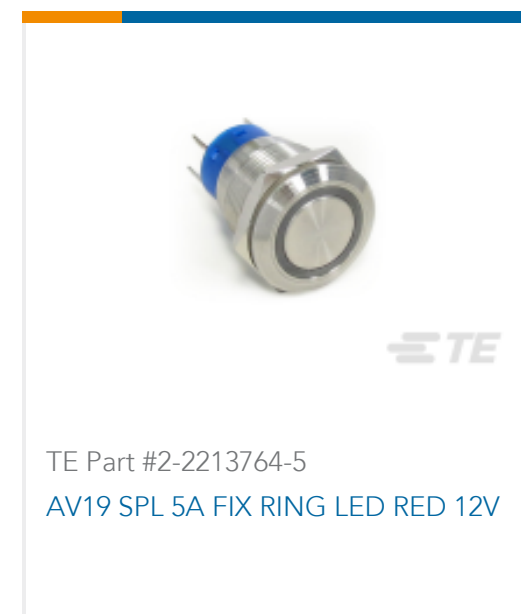
TE Part #2-2213764-5 AV19 SPL 5A FIX RING LED RED 12V CONT