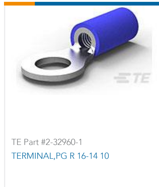
TE Part #2-32960-1 TERMINAL,PG R 16-14 10