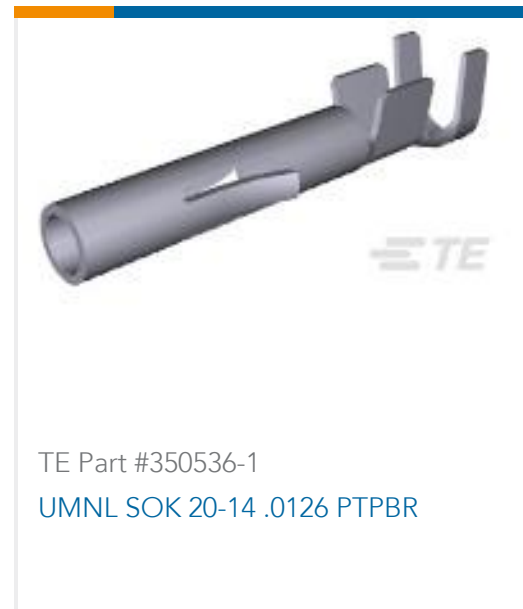
TE Part #350536-1 UMNL SOK 20-14 .0126 PTPBR