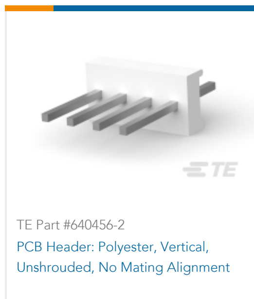
TE Part #640456-2 PCB Header: Polyester, Vertical, Unshrouded, No Mating Alignment