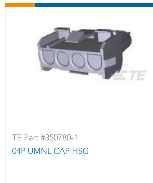
TE Part #350780-1 04P UMNL CAP HSG