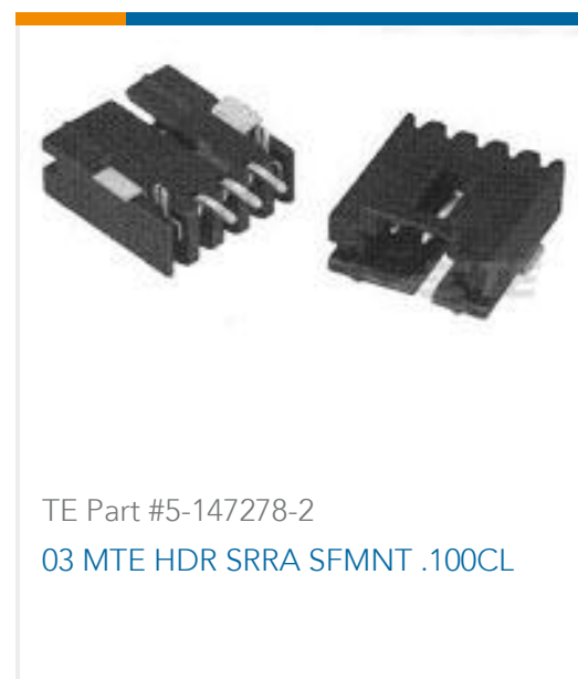
TE Part #5-147278-2 03 MTE HDR SRRA SFMNT .100CL