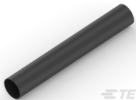
TE Part #NB17694001 VERSAFIT-1-1/2-0-SP