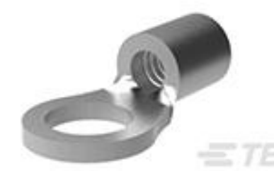
TE Part #322242 TERMINAL,SOLIS R 12-10 3/8