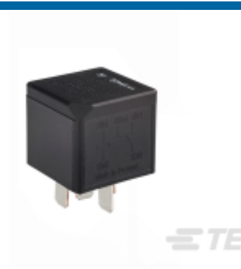
TE Part #4-1414992-7 V23136A0004X086-EV-CBOX