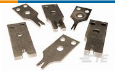
TE Part #456422-2 CRIMPER WIRE .110 F