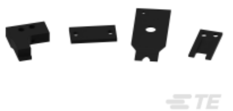
TE Part #240644-1 PLATE-REAR SHEAR