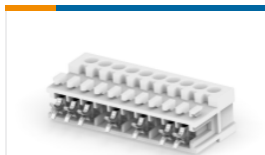
TE Part #1-2232890-0 10P MONOPLUG 2.5 SELECTIVELY LOADED