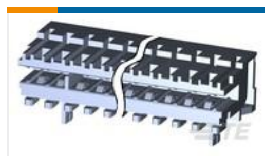
TE Part #3-1534796-9 AMP DUOPLUG MK2 CONNECTOR 9P