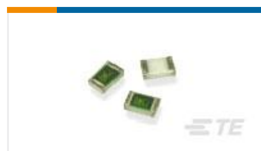
TE Part #1676317-2 RN 0805 37K4 0.1% 10PPM 1KRL