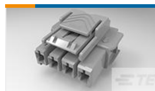
TE Part #6-1971773-4 PTL 1X4 PLUG HSG HIGH TEMP KEY B RED