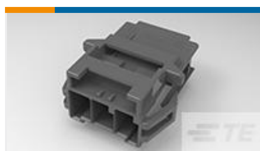
TE Part #5-2232263-3 PTL 1X3 CAP PANEL MT GLW WIRE KEY A DGR